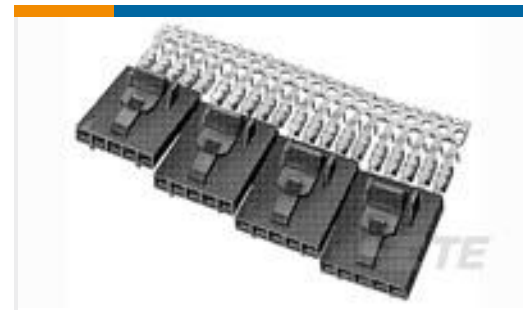
TE Part # 103961-8 2X9 MTE RCPT SR LATCH .100CL