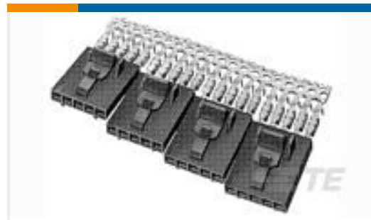
TE Part # 103958-8 2X9 MTE RCPT SR LATCH & POL